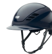
AirLux Pure shiny midnight blue