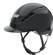
AirDuo shiny black