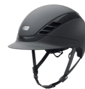
AirLux Pure black matt