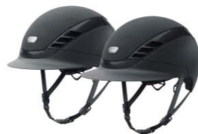
AirLux Supreme black