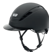
AirDuo black matt