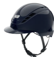
AirDuo shiny midnight blue