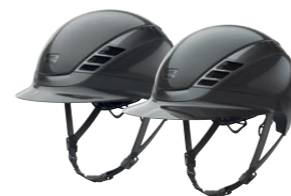
AirLux Chrome shiny black