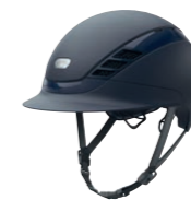
AirLux Pure midnight blue matt