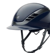
AirLux Chrome shiny midnight blue