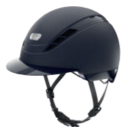
AirDuo midnight blue matt