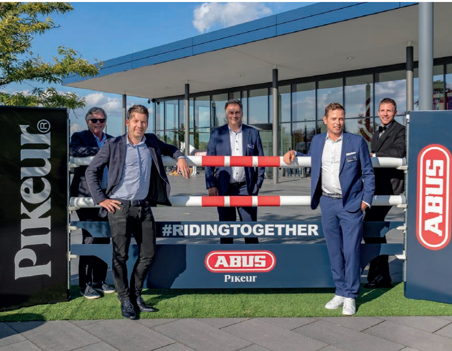
Press photo with members of the owner families Brinkmann (PIKEUR) and Bremicker (ABUS)

When a long-standing bike helmet specialist collaborates with the leading equestrian sports outfitter and internationally successful athletes, a new era in the world of riding helmets begins: