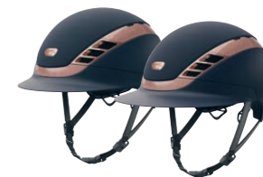
AirLux Supreme midnight blue rosé gold