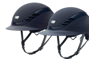
AirLux Supreme midnight blue